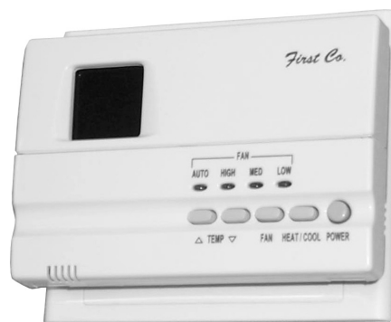
(Shown with wall plate)

For ceiling fan coils and vertical console units, optional controls are factory installed, which include the control board, transformer, and disconnect switch. For MB/MB-HW and CW/CW-HW/CWE series upflow or horizontal fan coils, the optional control board and transformer can be factory installed inside the unit wiring compartment. A disconnect switch is not available with the MB/MB-HW and CW/CW-HW/CWE models.